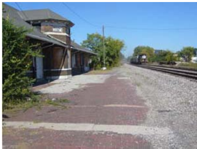
Brick Platform (rear elevation)

The Cleveland Southern Railway Depot in Cleveland (pop. 37,311), Bradley County, Tennessee is located on 175 Edwards Street SE near the intersection of Edwards Street SE and Inman Street SE. The depot features Craftsman Style details with an irregular floor plan. Its main façade faces west on Edwards Street. The nominated site includes 1.3 acres and is owned by the Southeast Tennessee Human Resources Agency (SETHRA). The depot property is part of a 3.20 acre parcel owned by Norfolk Southern. Located directly south of the depot, stands the original brick combination depot (passenger/freight), which was built circa 1869 and is presently the Norfolk Southern Freight Depot office. The rear (east) elevation of the building faces the tracks, the Norfolk Southern railroad yard, and a trailer parking area for the Maytag Corporation. The facade of the building features a paved brick walkway that is approximately 8 feet in width and spans the length of the depot, and the rear elevation (trackside) features a large brick passenger platform. The nominated portion of the brick platform extends approximately 8 feet from the rear of the building and spans the length of the building. Norfolk Southern owns the remaining portion of the brick platform. Originally, the brick platform was approximately 300 feet in length and 30 feet in width. It has experienced many alterations since the early 1970s, as many of the bricks have been removed or covered with asphalt. 1