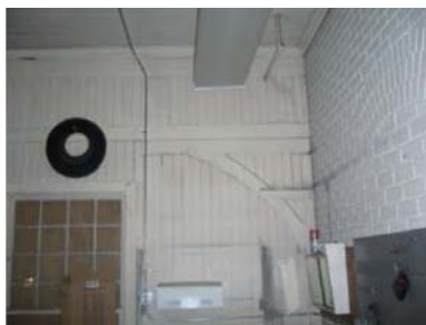
Workshop/Enclosed Section (North Elevation)

The property was recently purchased by the Southeast Tennessee Human Resources Agency (SETHRA) to convert into a bus transit station. It is their desire to restore the depot following the Secretary of Interior's Standards for Rehabilitation. They plan to remove the drop ceiling, sheet rock walls, ceramic tile flooring, wood paneled walls, and restore the north elevation to its original appearance. The rehabilitation of the Cleveland