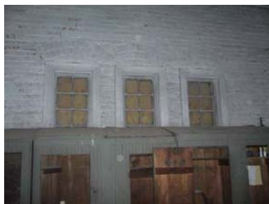
Baggage Room (South Wall)