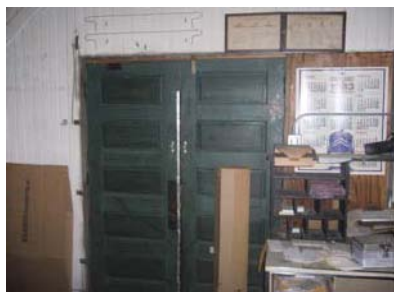
Original Five-Paneled Wood Doors

The section located directly north of the white waiting room, was enclosed in the 1970s to create more office space and a workshop. The office, located in the western half, includes two 16:2 sash windows on the north wall and one 16:2 sash window on the west wall with a replacement door. The 16:2 windows were removed from their original locations on the east and west elevations and placed in the added office in the late 1970s. In addition, wood paneled walls and a drop ceiling were installed. The workshop, located in the eastern half, features two original wood paneled doors on the north wall and two 16:2 sash windows on the east wall. The windows in the workshop were removed from the south brick wall which had served as the original north elevation. The south wall is brick and originally featured two 16:2 sash windows and one twelve-light window on either side. After the windows were removed, the openings were filled with brick.