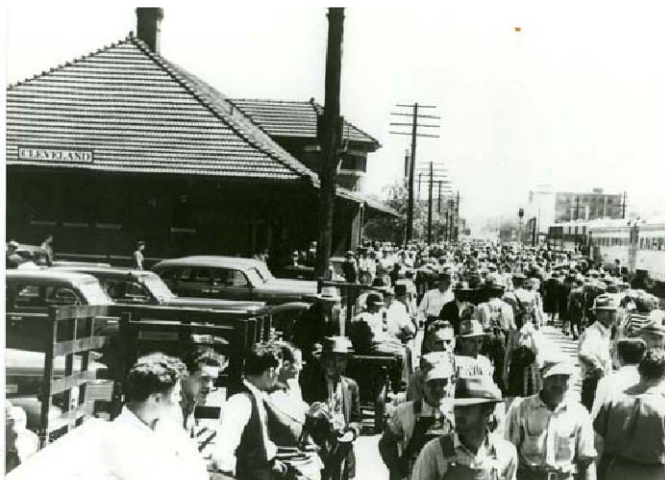
Spectators viewing the “Tennessean” at the Cleveland Depot in May of 1941

Cleveland Southern Railway Depot Bradley County, Tennessee