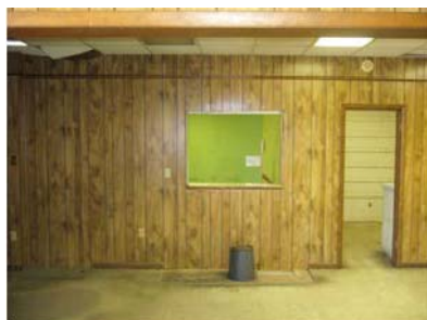
Converted Office (originally ticket office)

The depot's interior experienced much alteration when passenger service ceased in 1970 and the Norfolk Southern freight offices moved into the building. Sheet rock walls and a drop ceiling were constructed in the ticket office and two passenger rooms to create individual offices. The only room that remained fully intact is the baggage room.