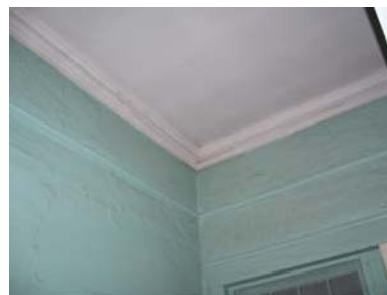
Crown Molding (White Waiting Room)