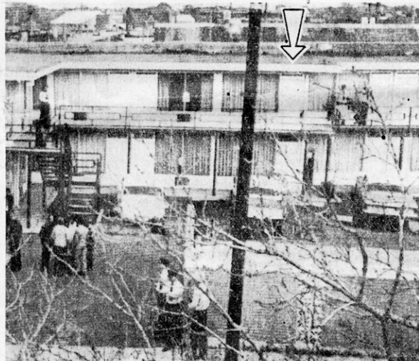
WHERE BULLET STRUCK KING—This is an overhead view of the Lorraine Motel as it swarmed with police last night after King was felled by an assassin's bullet. King was standing on the second floor balcony in front of his room door (arrow). King was struck in the neck and died a short time later.